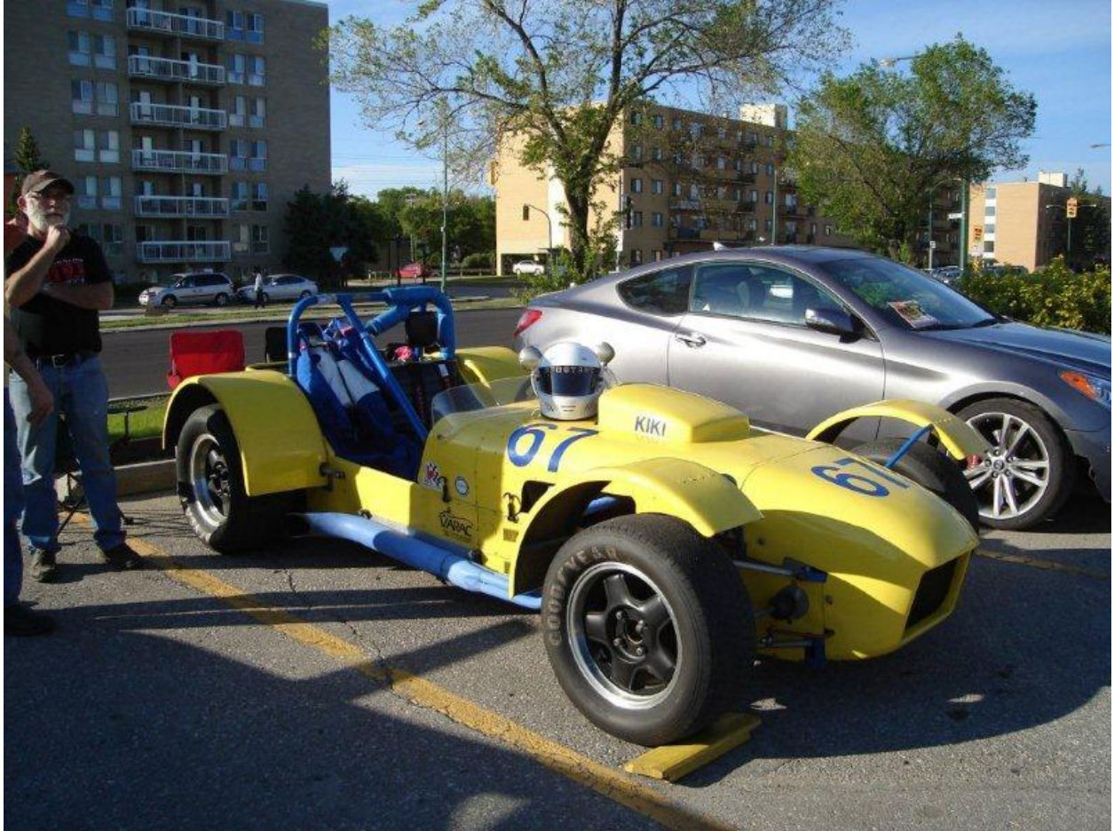
Another photo from the WSCC night at the Pony Coral